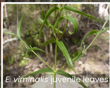
E. viminalis juvenile leaves

Flowers white, in groups on stalks 0.8cm long, usually 3 flowers per florescence (group of flowers).