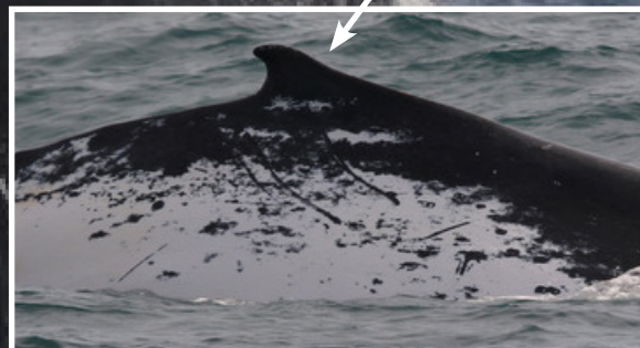
Prominent hook/knob dorsal fin