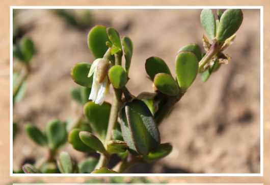
Leaves are paired in Y-shape; grey-green, ovate with narrow base; 1-4cm.

It is similar to the Shrubby Twin-leaf (Zygophyllum aurantiacum), but can be distinguished by the leaves. Z. aurantiacum has circular leaflets.