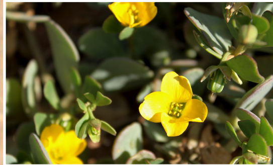
Flowers are bright yellow, with four petals growing between 8-15mm.